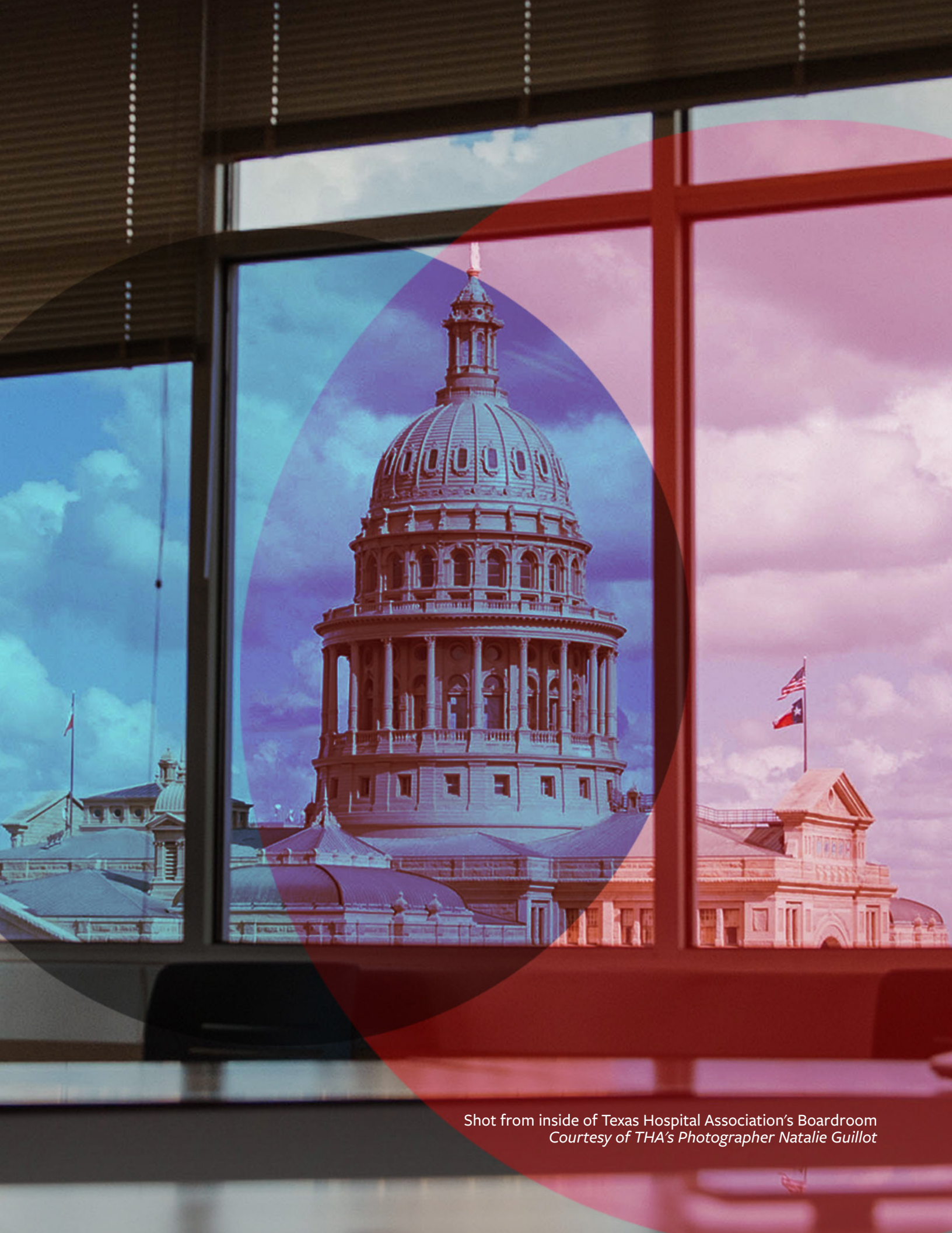
Shot from inside of Texas Hospital Association's Boardroom