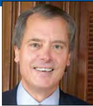
Texas Lt. Gov. David Dewhurst