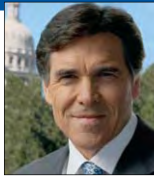
Texas Gov. Rick Perry

With health care spending accounting for about a third of the state's budget, issues such as accessible coverage have